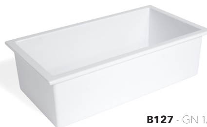
B127 - GN 1/3 12 3/4" x 6 3/4" x 3 3/4" h.