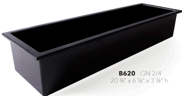
B620 - GN 2/4 20 3/4" x 6 1/4" x 3 3/4" h.