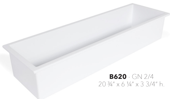
B620 - GN 2/4 20 3/4" x 6 1/4" x 3 3/4" h.