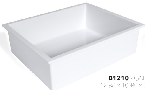
B1210 - GN 1/2 12 3/4" x 10 3/8" x 3 3/4" h.