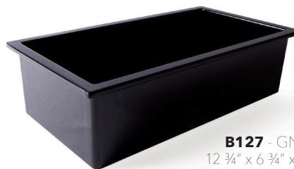
B127 - GN 1/3 12 3/4" x 6 3/4" x 3 3/4" h.